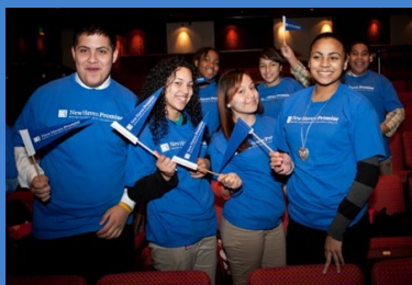
Support for Education