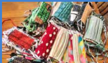
Yale Community for New Haven Fund