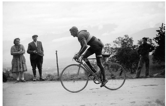
Gino Bartali in the Tour de France from a scene in the film My Italian Secret directed by Oren Jacoby